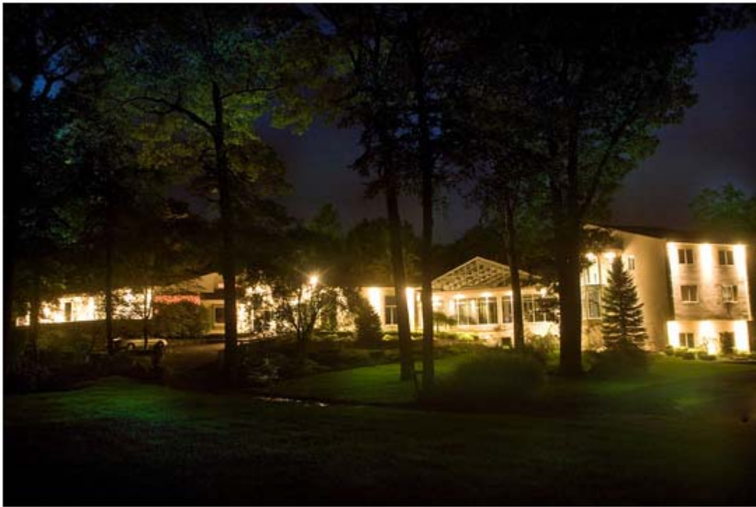
A nighttime view of the 14,000-square-foot estate on Conant Valley Road in Pound Ridge.