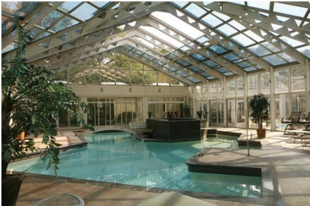
The home features two pools – an outdoor one and this indoor one.