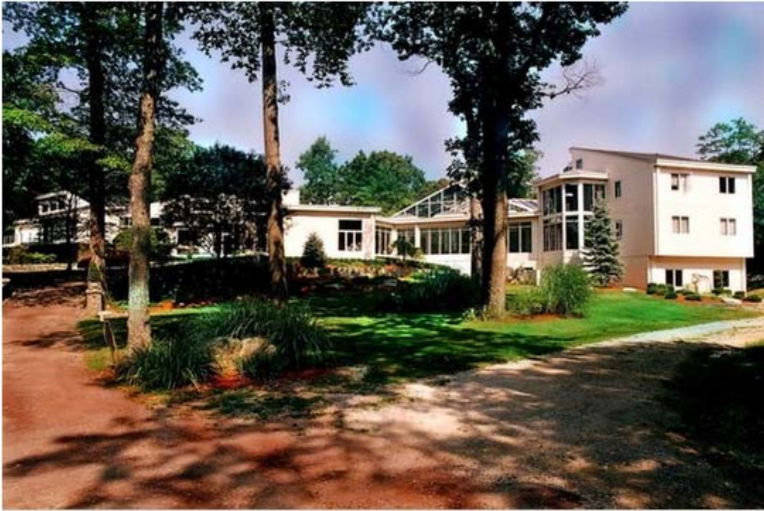
This six-bedroom modern mansion in Pound Ridge is up for auction. It sits on 5.8 acres and has a private hunting area.